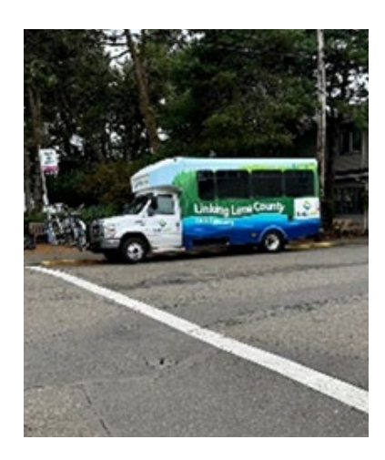
The Link Lane portion of the project funded by Confederated Tribes of Coos, Lower Umpqua, and Siuslaw Indians. Confederated Tribes of Coos Lower Umpqua and Siuslaw Indians partnership with Lane Council of Governments Florence to Eugene Route.

The Coquille Indian Tribe is finishing up the pilot program to increase service to Charleston to Coos Bay. The funding has been replaced with Statewide Transportation Improvement Fund funding through a partnership with Coos County Area Transportation District.